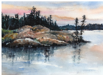
Tranquility Bay