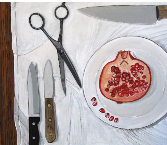
Persephone 2nd | Tanya Zaryski