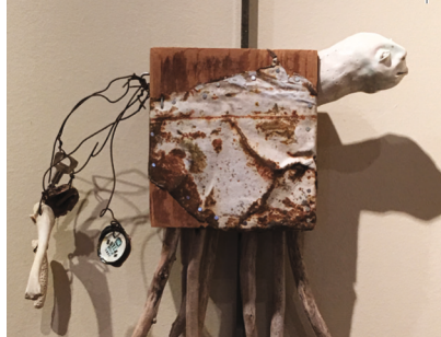
Found | Tanya Zaryski